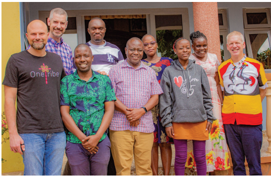
PCR Uganda Board and US team

It has been 29 years since the beginning of the Rwandan genocide and many thousands of lives have been impacted by this work of reconciliation throughout Rwanda and the Great Lakes region of Africa. This March we were able to spend time with the Rwandan Leadership Team and 30 Rwandan facilitators, along with many others who have experienced healing, reflecting on all that God has done and refreshing the understanding of the principles and values of this ministry. We celebrated the 20th anniversary since the establishment of the Rwandan Pilgrim Center organization: We heard testimonies of how many had been personally healed and reconciled through the PCR ministry and how they were now taking the ministry into their families, churches, and communities.