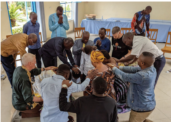
PCR Congo facilitator prayer

Our recent trip to Uganda gave us the opportunity to see what God is doing through the leaders there. We were able to connect with the PCR Uganda Board to hear and see the ministry that is expanding throughout Uganda. We were even able to participate in a 3-Day Healing & Reconciliation Retreat for Pastoral Couples where we later heard testimonies of how God used the time to bring healing and wholeness to those who were gathered. We were also able to connect with other ministry leaders who are passionate about seeing the work continue to grow and flourish in Uganda.