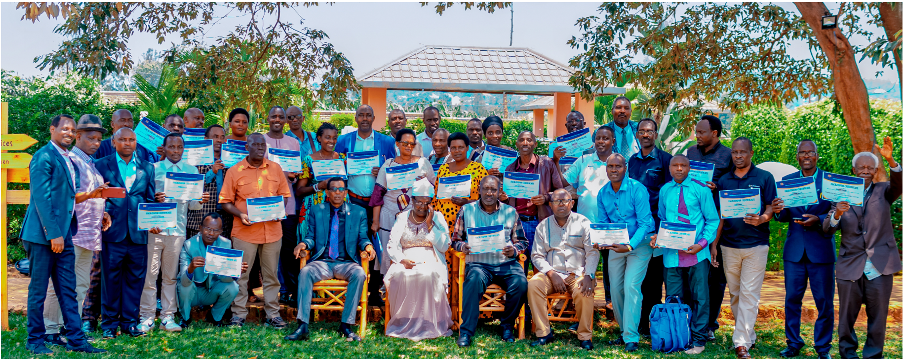
Leaders from Democratic Republic of Congo and Rwanda met in Rwanda for a joint Training Retreat hosted by leadership of PCR Rwanda and PCR DRC, October 2022.